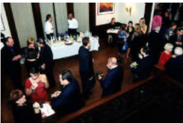
Zabava guests socializing at the Institute