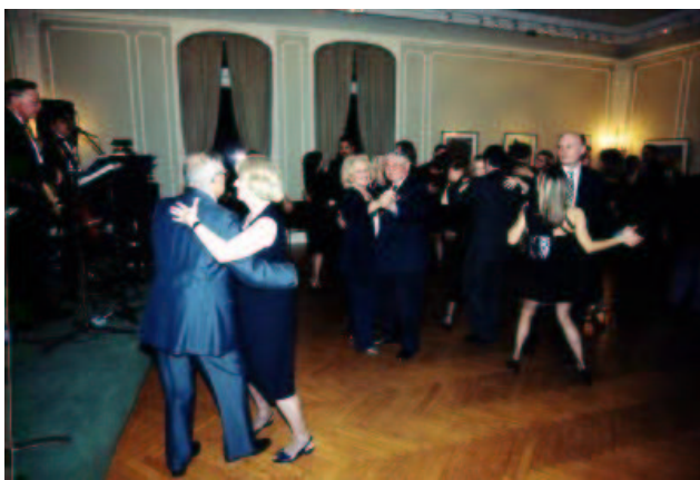
Zabava guests dancing in the Institute's main hall to the musical sounds of the orchestra "Luna."