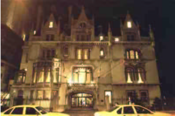
Ukrainian Institute of America