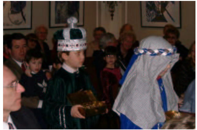
Children performing in a traditional Nativity play