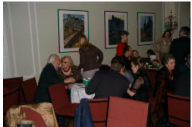
Yalynka guests socializing after the evenings entertainment