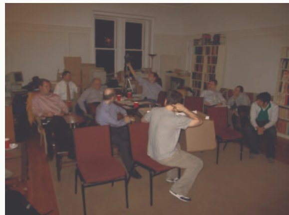
Lecture attendees participating in a Question and Answer session

NEW YORK - On April 7, 2005, the New York City Chapter of the Ukrainian Engineer's Society of America held a "Resume and Job Hunting" Workshop. The Workshop was targeted to those that are entering the workforce in the United State for the first time or are looking to switch careers. The workshop consisted of four short presentations by speakers with a range of experience followed by a group question and answer session.